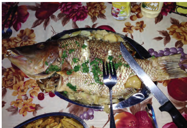
Figure 1: Dog snapper eaten by a 39-year-old man while in Cuba (case 1).

His symptoms continued intermittently, with noted exacerbations following heavy exercise and alcohol consumption. Exacerbations occurred on three occasions over the subsequent month