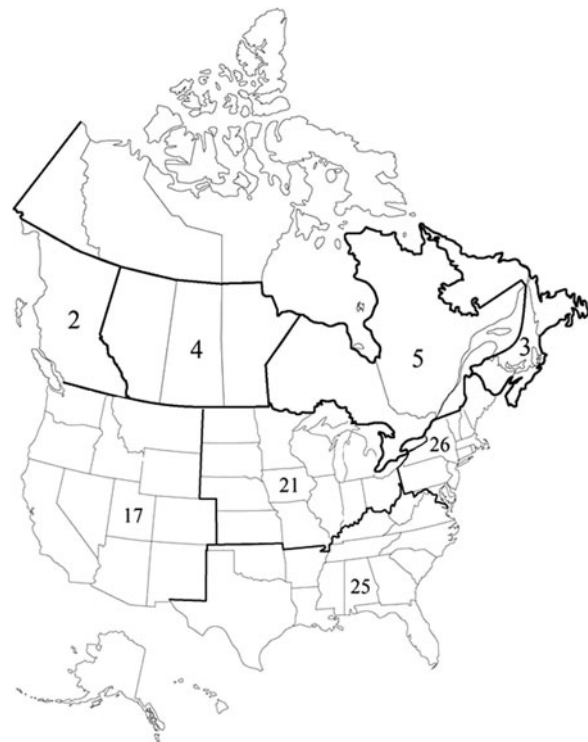
FIG. 1. Geographic location of surveyed mothers of infants with phenylketonuria living in the United States and Canada.

Several factors were assessed in relation to the duration of breastfeeding using \chi^2 analysis. Only one variable—the timing of when standard commercial infant formula was added